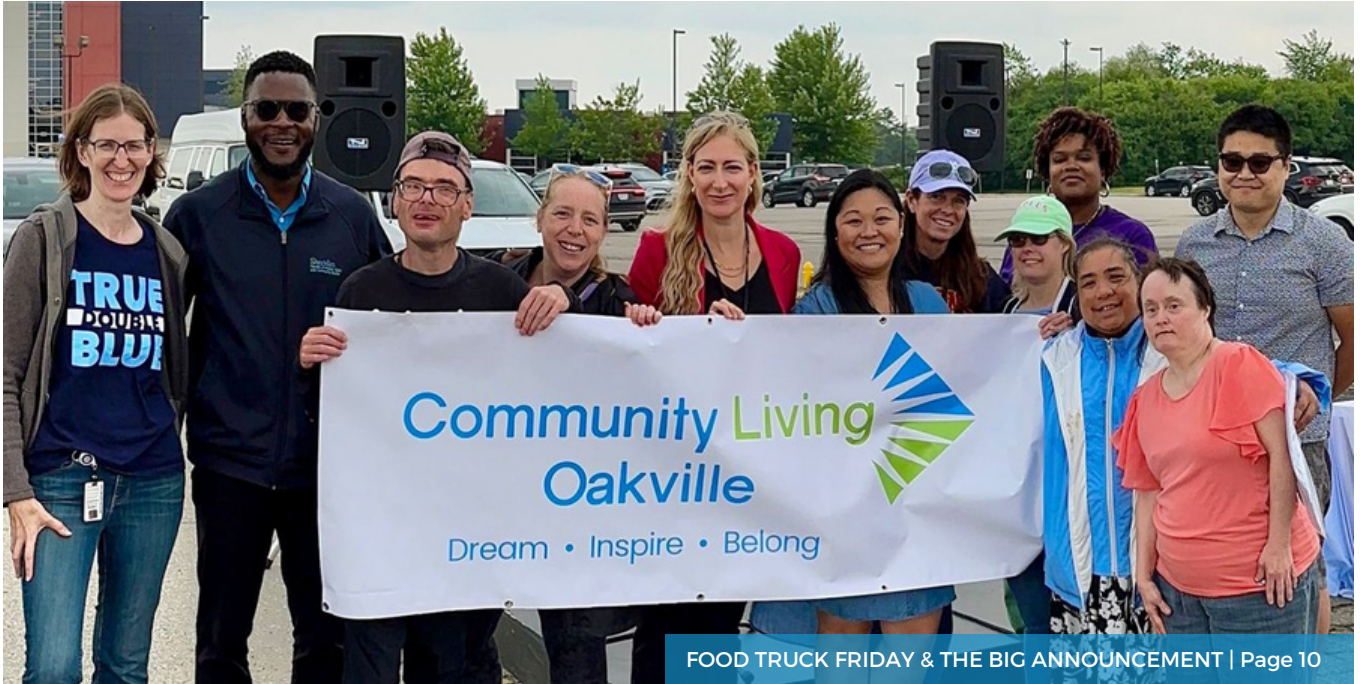
FOOD TRUCK FRIDAY & THE BIG ANNOUNCEMENT | Page 10