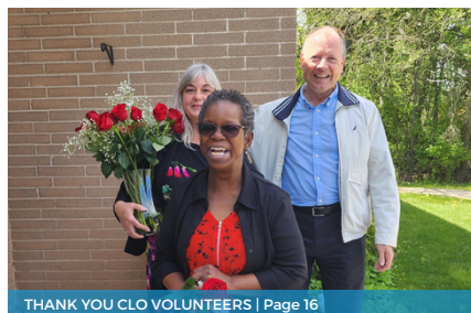
THANK YOU CLO VOLUNTEERS | Page 16