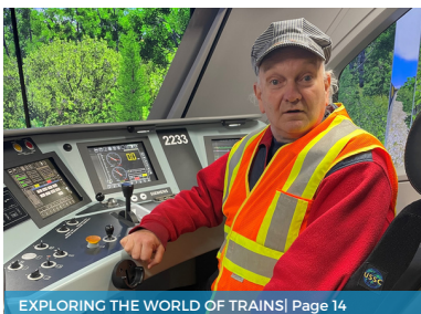
EXPLORING THE WORLD OF TRAINS | Page 14