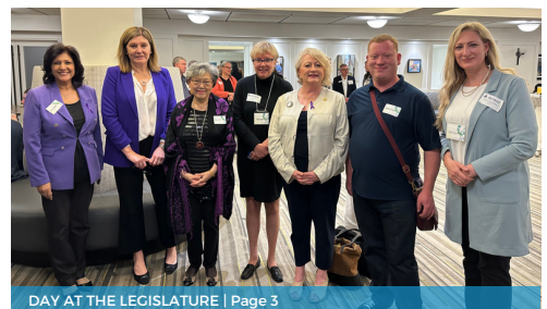
DAY AT THE LEGISLATURE | Page 3