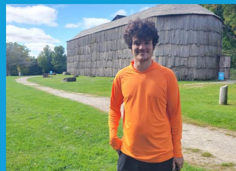
Take a look back at some images and experiences we enjoyed in 2021 - See Page 10