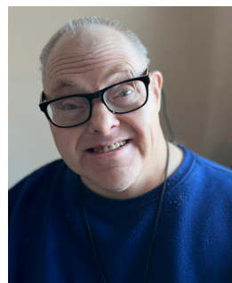
Warren Wright Security